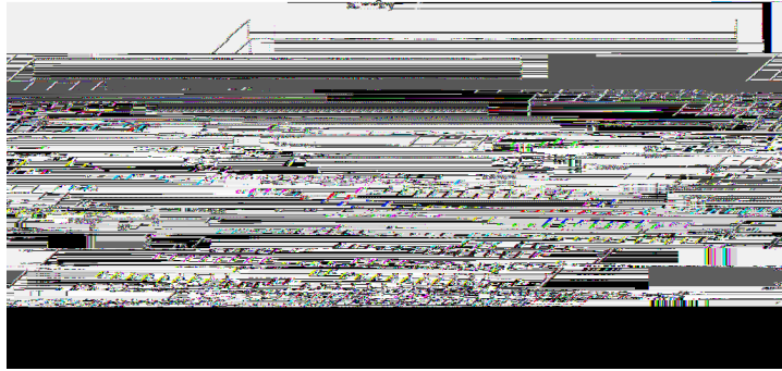
Fig. 6. System workload during each test configuration (10 in total), and the baseline for a point of reference.

uncontrolled cores are now displaying a substantial amount of load, even when compared to controlled cores. The average load of uncontrolled cores is 30.43%, while controlled cores average 64.45%.