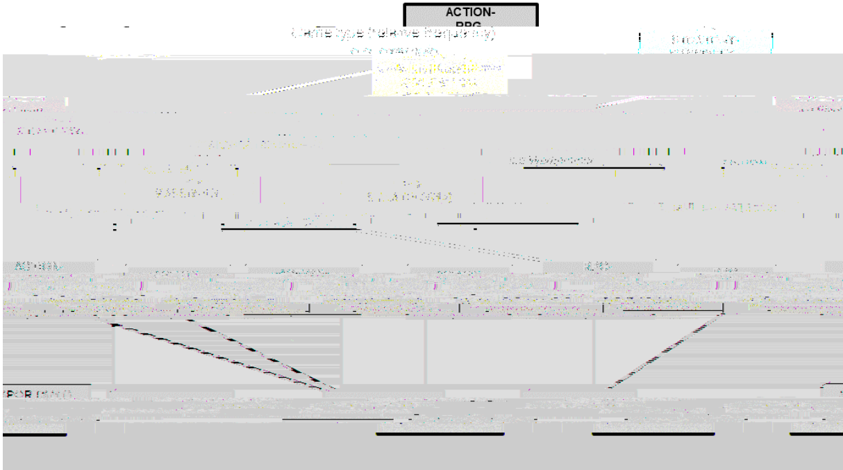
Fig. 1. Game types, or nodes in the lattice of game genres.